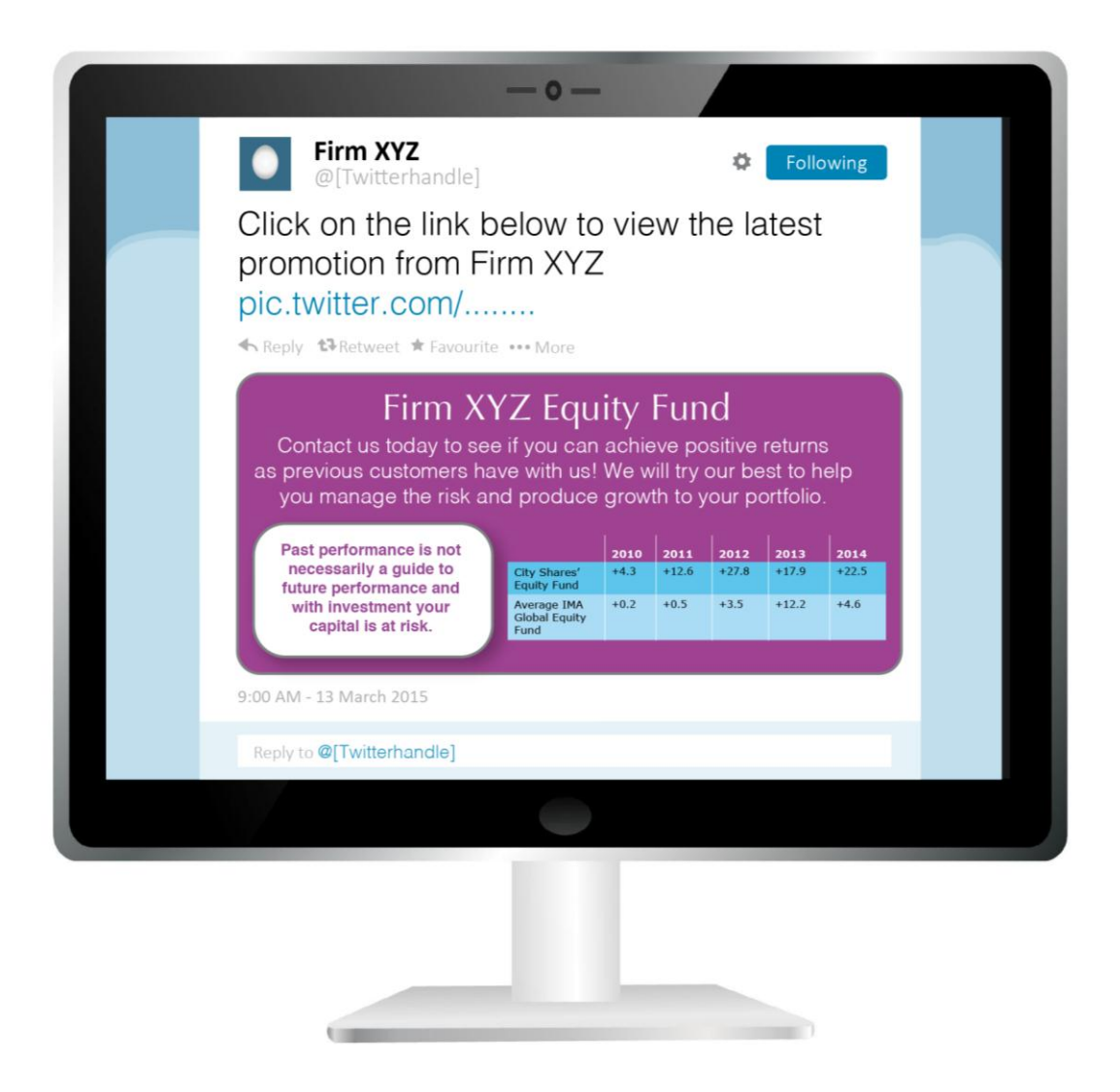
Figure 5: Investment inserted images example.