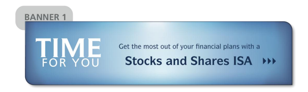
Figure 4a: Example of a non-compliant banner promotion. The risk warning is lost in surrounding text, which is also of much smaller font-size