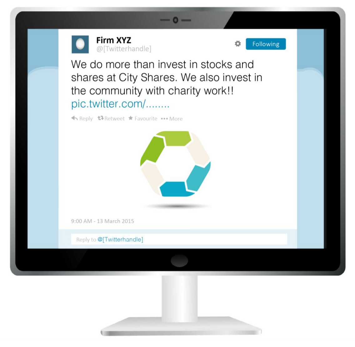
Figure 1: A non-promotional communication that focuses on the firm's non-regulated activities

1.5 A financial promotion must also be made 'in the course of business' to be within our regime. We have published guidance on this in our Perimeter Guidance manual (PERG). The 'in the course of business' test requires a commercial interest on the part of the communicator. It is intended to exclude genuine non-business communications. Social media conversations involving groups and individuals not acting in the course of business are therefore outside our regulation.<sup>2</sup> Where capital is raised for small private companies