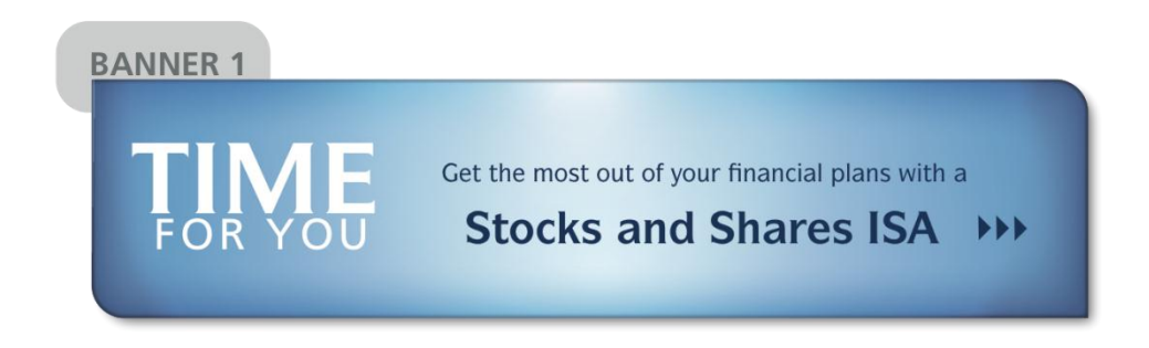
Figure 4: Example of a compliant banner promotion. The risk warning is clear in the last frame of a dynamic banner

1.11 Each communication (e.g. a tweet, a Facebook insertion or page, or web page) needs to be considered individually and comply with the relevant rules. Figure 4 shows how this can be achieved through a banner promotion. By contrast, Figure 4a shows a non-compliant version where the risk warning is not clear.