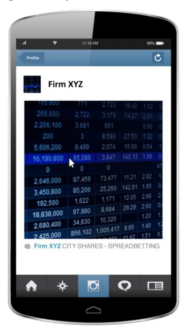
Figure 7: Compliant