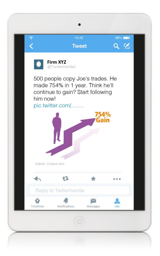
Figure 3: Example of a fair, clear and not misleading tweet, conveying a prominent warning within the character limitation